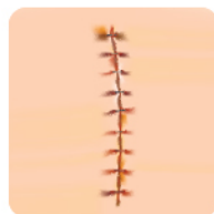
傳統開刀腎臟切除手術後傷口 Open Nephrectomy