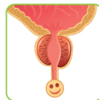
術後(排尿暢順) After Surgery (No obstruction)