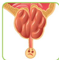
術前(前列腺阻塞) Before Surgery (Obstruction)