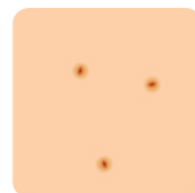
微創腹腔鏡腎臟切除手術 Laparoscopic Nephrectomy