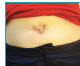
微創單孔腹腔鏡腎臟切除手術 Laparoscopic Single Port Nephrectomy