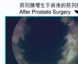
前列腺增生手術後的前列腺 After Prostate Surgery