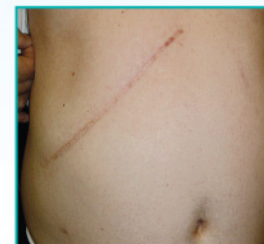
傳統開刀腎臟切除手術後傷口 Open Nephrectomy