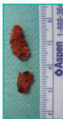
輸尿管石 Ureteric Stones