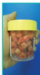
膀胱石 Bladder Stones