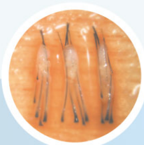
▲ 毛囊單位 follicular unit

◀ 取出的頭髮會用顯微鏡小心處理。 The extracted hairs would be trimmed under microscope.